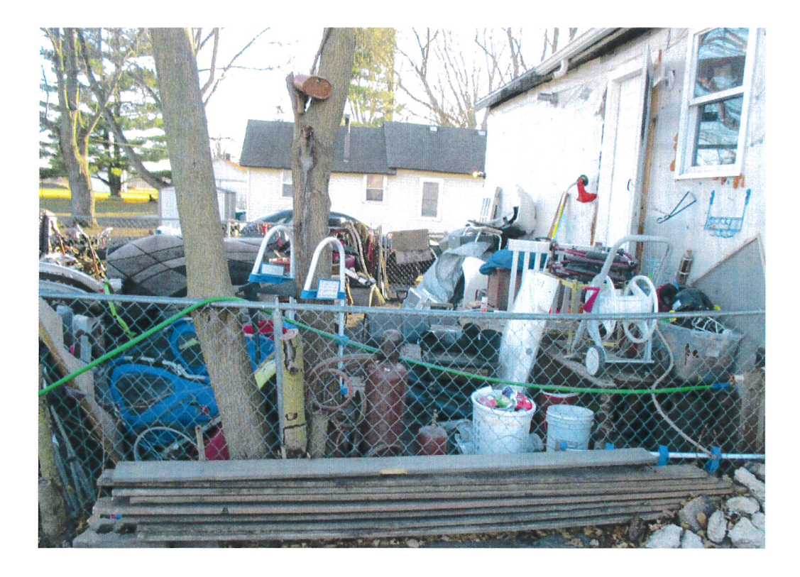
Date: 12/16/21 Time: 2:44 PM Direction: South Photo by: Brooke Schumacher Exposure #: 14 Comments: Open dumping, including household waste found east of home

Date: 12/16/21 Time: 2:43 PM Direction: South Photo by: Brooke Schumacher Exposure #: 13 Comments: Area of burn pile, includes charred food waste, and charred food packaging