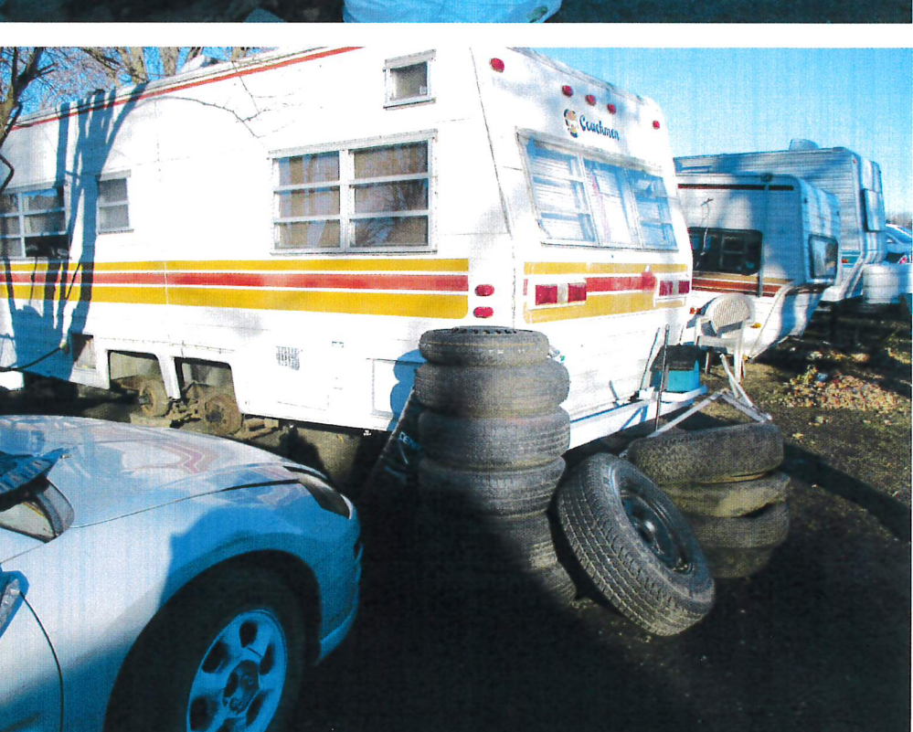
Date:12/16/21 Time: 2:41 PM Direction: East Photo by: Brooke Schumacher Exposure #: 8 Comments: Tires near trailer, east of residence

Date: 12/16/21 Time: 2:40 PM Direction: Northeast Photo by: Brooke Schumacher Exposure #: 7 Comments: Household garbage located along south facing fence line