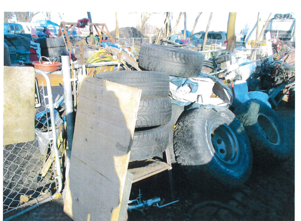
Date: 12/16/21 Time: 2:40 PM Direction: Northeast Photo by: Brooke Schumacher Exposure #:4 Comments: More tires found along south fence

Date: 12/16/21 Time: 2:40 PM Direction: Northeast Photo by: Brooke Schumacher Exposure #: 3 Comments: Batteries found along south side of home comingled with tires