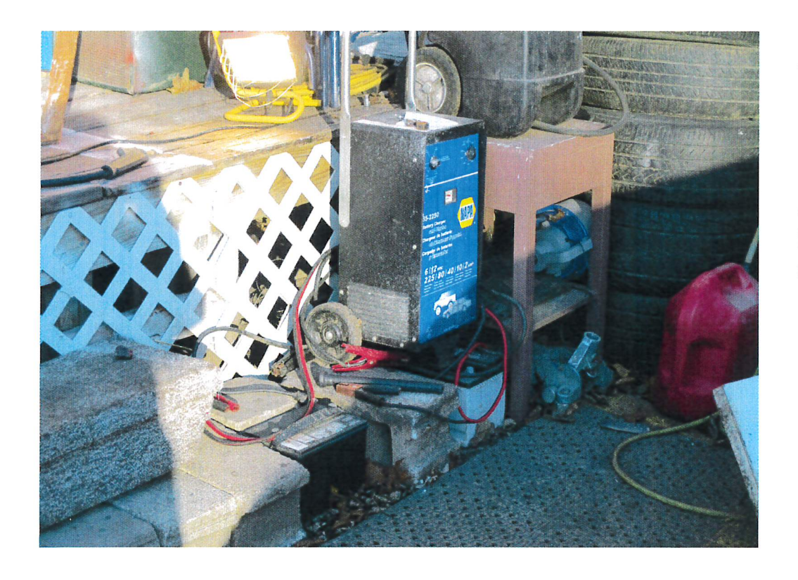
Date: 12/16/21 Time: 2:39 PM Direction: Northeast Photo by: Brooke Schumacher Exposure #:2 Comments: Batteries located on the ground

Date: 12/16/21 Time: 2:37 PM Direction: East Photo by: Brooke Schumacher Exposure #: 1 Comments: Tires along south side of residence