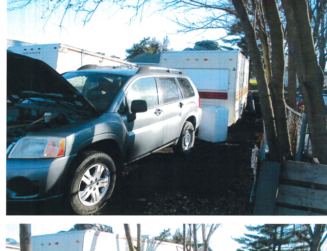
Date:12/16/21 Time: 2:43 PM Direction: South Exposure #: 12 Comments: Multiple gas cans, shoes, litter, a box fan, various car parts along side south and east fence line